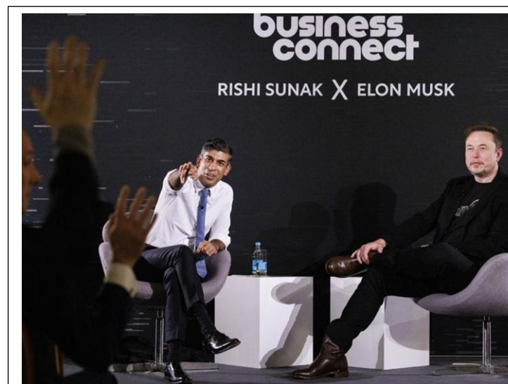
smarter than the smartest human.

Prime Minister Sunak organized this summit with the aim of positioning the UK at the forefront of global efforts to address the risks posed by rapidly advancing AI technology, which he noted could extend to the point of human extinction.